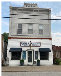
1882 Hudson Grocery Store 2021 Christian Visitors Center