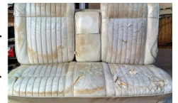
Before and after shots of some Cadillac seats

J&J specializes in original style interior restorations in cars and trucks from the 20's through the 70's. And have also done many full custom interiors, that can be seen at car shows around the area. They also do boat upholstery, custom golf cart seats, and have recently branched out into custom motorcycle seats. Most of their work has come from custom car builders, looking for an upholstery shop that understands the importance of working with the customer's vision to create a reality.